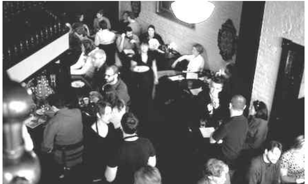
District Council fundraising dinner at the Strip Club restaurant